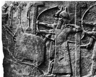
Relief of Lachish under attack by Syrians

To register For information: Apologetics Research Society Phone: 858 505-8841 E-mail: joakes01@san.rr.com