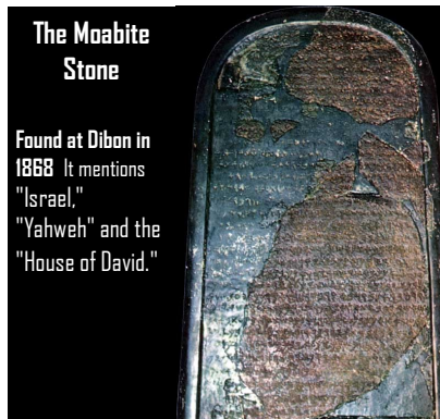
The Moabite Stone

Found at Dibon in 1868. It mentions "Israel," "Yahweh" and the "House of David."