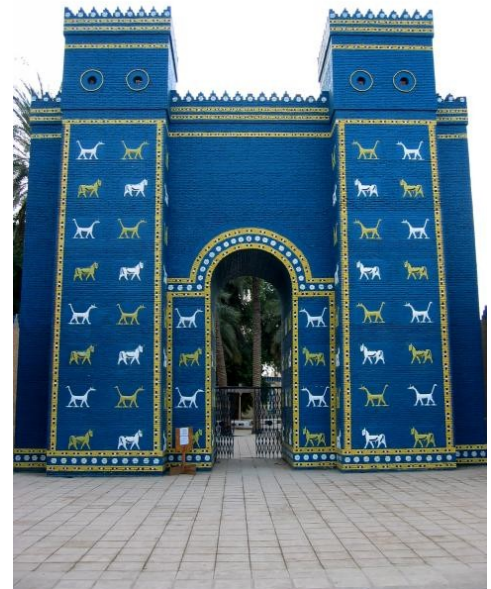
Babylon's Ishtar Gate